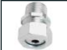
Strain relief straight connectors-01