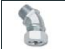
45 degree strain relief straight connectors-01