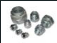
Straight-uninsulated malleable iron-01

You also may use these words to find this website EMT fittings electric fittings emt conduit ductile iron pipe fittings electrical conduit fittings electrical pipe fittings malleable iron pipe fittings electrical metallic tubing fittings Rigid and IMC fittings electric fittings,steel fittings steel electrical fittings electrical conduit fitting electric fitting electrical pipe fittings stainless steel electrical fittings