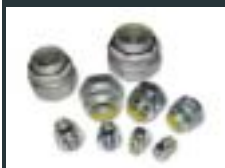
Straight-insulated malleable iron-01