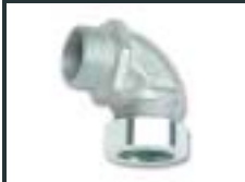
90 degree short angle connectors-01

Down Load: Malleable iron fittings DOC , Malleable iron fittings PDF , Malleable iron fittings Manufacturer, Supplier, Factory, Exporter in china