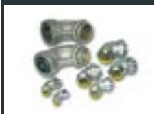
90 Degree-insulated malleable iron-01