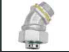
45 Degree-uninsulated malleable iron-01