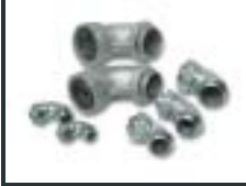
90 Degree-uninsulated malleable iron-02