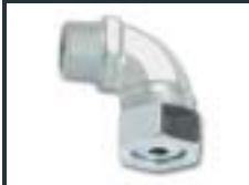
90 degree strain relief straight connectors-01